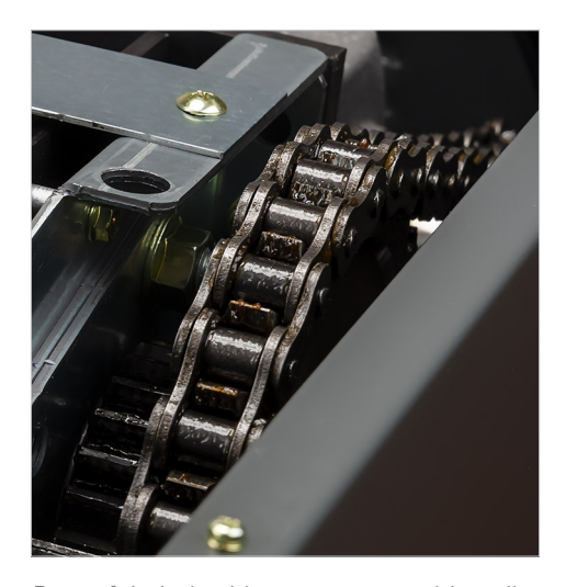
Powerful chain-driven motor provides slipfree performance.