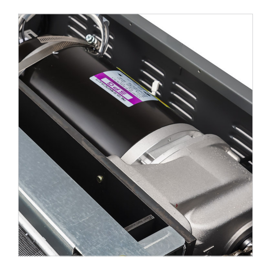
The continuous duty motor won't overheat under frequent use.